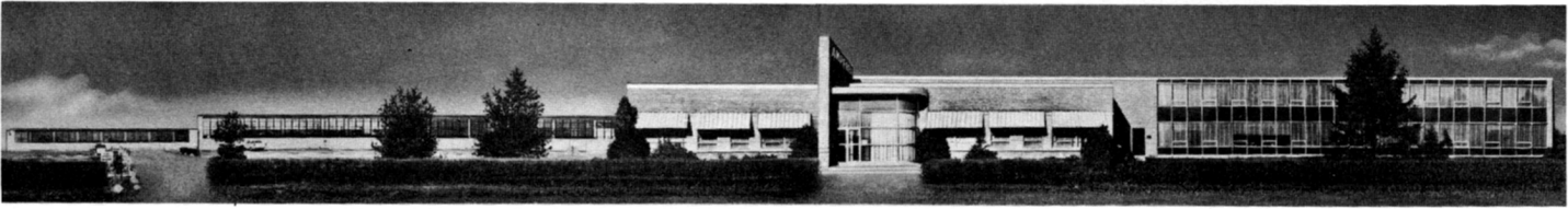
Amperex Electronic Corporation, Hicksville, Long Island, New York Sales Offices, Engineering Laboratories and Tube Manufacturing Plant