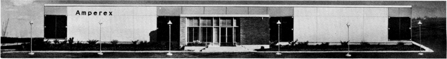
Amperex Semiconductor and Receiving Tube Division Slatersville, Rhode Island